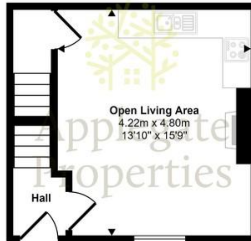
Ground Floor Approx 24 sq m / 262 sq ft