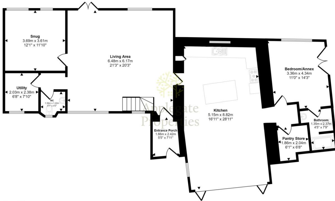
Ground Floor Approx 143 sq m / 1537 sq ft

This floorplan is only for illustrative purposes and is not to scale. Measurements of rooms, doors, windows, and any items are approximate and no responsibility is taken for any error, omission or mis-statement. Icons of items such as bathroom suites are representations only and may not look like the real items. Made with Made Snappy 360.