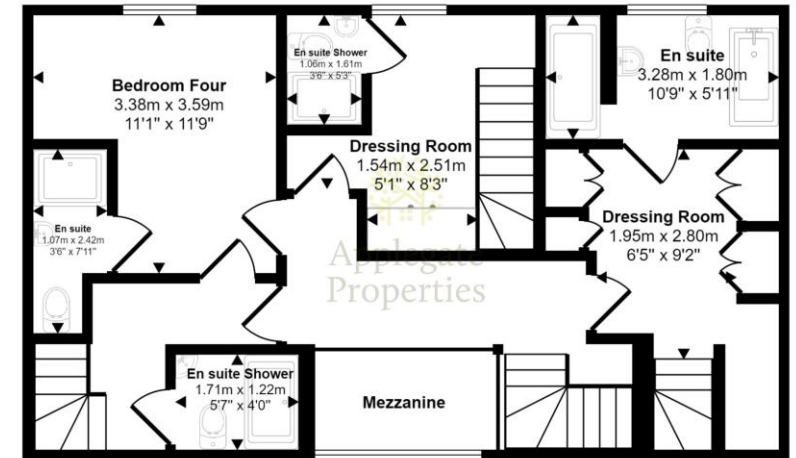
First Floor Approx 59 sq m / 636 sq ft

This floorplan is only for illustrative purposes and is not to scale. Measurements of rooms, doors, windows, and any items are approximate and no responsibility is taken for any error, omission or mis-statement. Icons of items such as bathroom suites are representations only and may not look like the real items. Made with Made Snappy 360.