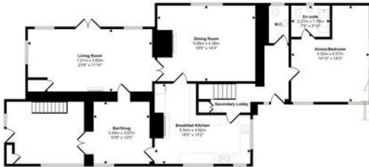
Ground Floor Approx 151 sq m / 1628 sq ft