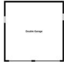
Double Garage Approx 32 sq m / 343 sq ft

This document is only for illustrative purposes and is not to scale. Measurements of rooms, areas, volumes, and any other are approximate and no responsibility is taken for any error, omission or misstatement. Some of items listed as bathroom fixtures are representations only and they are not included in the price. Model with House Strategy 100.