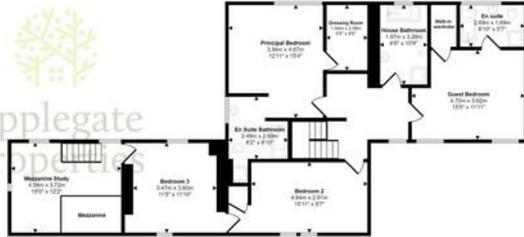
First Floor Approx 119 sq m / 1284 sq ft